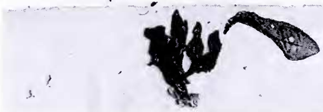
Figure 1. Lectotype of Pinguicula hirtiflora Ten., conserved in NAP.